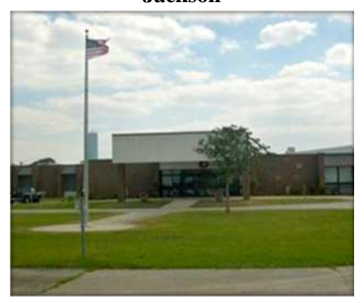
4739 Hwy 10, Jackson, LA 70748

This 129 bed facility is located on 82 serene acres and offers a variety of amenities including two fishing ponds, a greenhouse, a nature trail, and a chapel. The staff provides complete medical care including skilled nursing, physical therapy, occupational therapy, speech therapy, Alzheimer/Dementia care, and transportation services. Go to <a href="https://www.vetaffairs.la.gov/wp-content/uploads/Strategic-Plan-FY20-FY25-Jackson.pdf">https://www.vetaffairs.la.gov/wp-content/uploads/Strategic-Plan-FY20-FY25-Jackson.pdf</a> to view the LA Veterans Home's 2020 thru 2025 Strategic Plan.