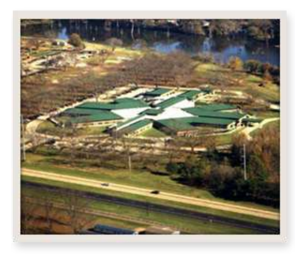
6700 Hwy 165 North, Monroe, LA 71203