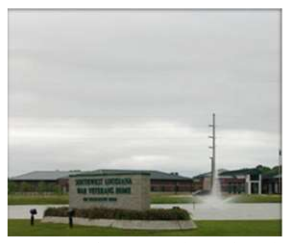
1610 Evangeline Rd, Jennings, LA 70546

This 156 bed facility opened on November 14, 2004 and is located on 40 majestic acres in Jennings, Louisiana. Features include a 4½ acre fishing lake with pier, large chapel and an activities building complete with a sports and game lounge and provides complete medical care including skilled nursing, physical therapy, occupational therapy, speech therapy, Alzheimer/Dementia care, and transportation services. Go to <a href="https://www.vetaffairs.la.gov/wp-content/uploads/Strategic-Plan-FY20-FY25-Jennings.pdf">https://www.vetaffairs.la.gov/wp-content/uploads/Strategic-Plan-FY20-FY25-Jennings.pdf</a> to View the SW LA Veterans Home's 2020 thru 2025 Strategic Plan.